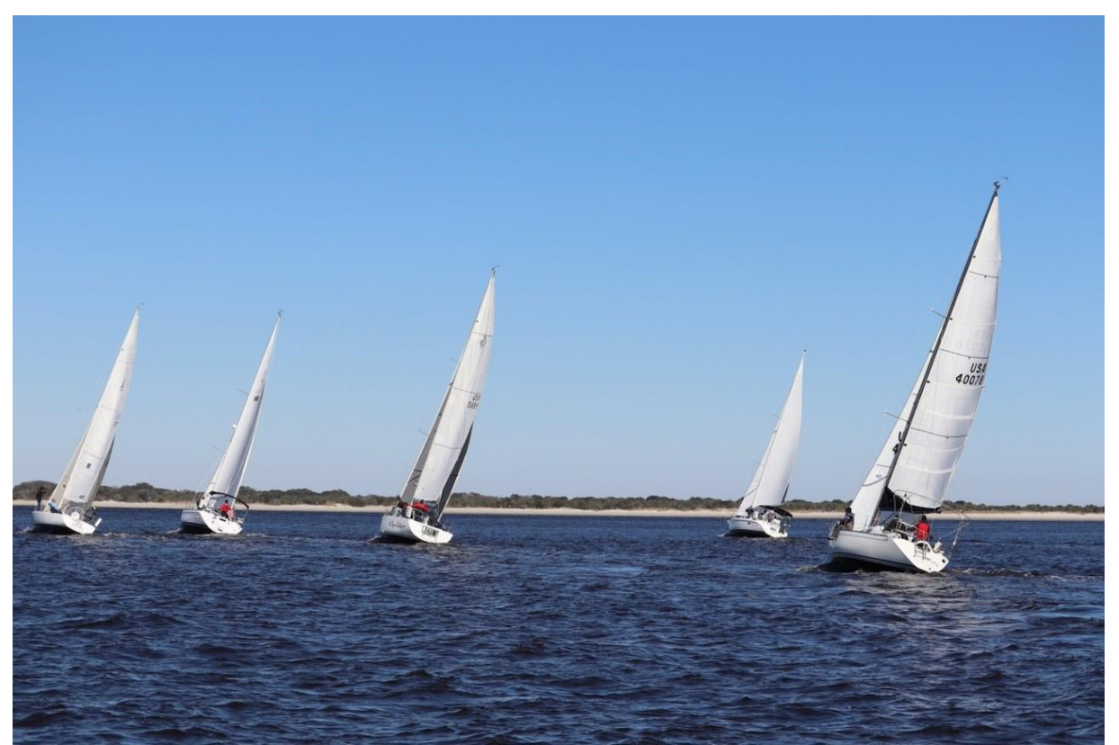
Valkyrie, Morning Glory, Tiger Tale, Salty Sally and Misty bear towards Cumberland Island