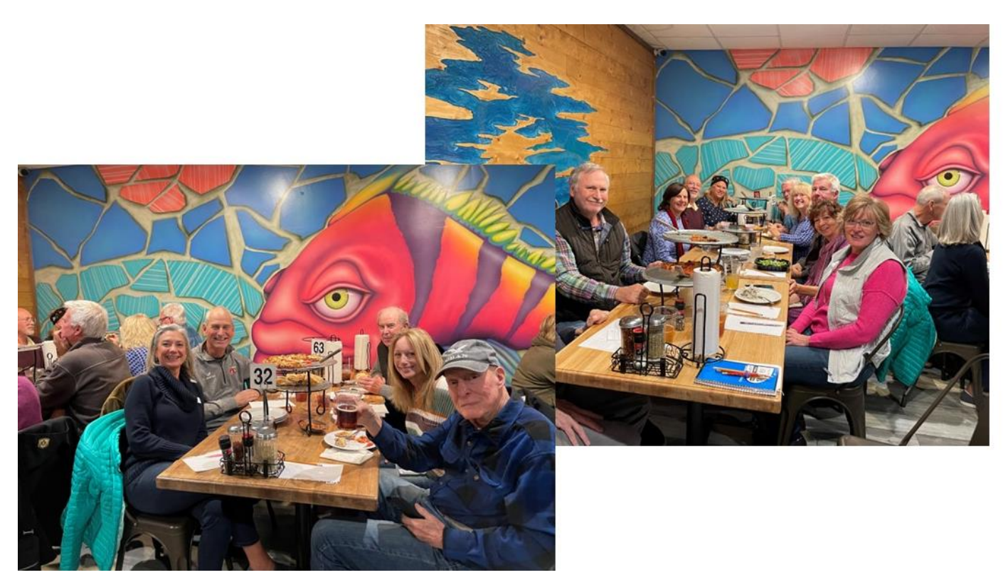
January Trivia at V Pizza

We didn't win but we had a great time! Come join us. We'll meet the third Wednesday of the month at 6:00 for dinner and 7:00 for trivia. We'll send an email reminder a couple days before. You need to let us know if you're coming so we can save the right number of seats.