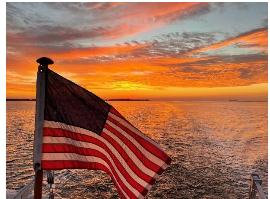
Great sunrise aboard Tipsy Turtle near Tarpon Springs.