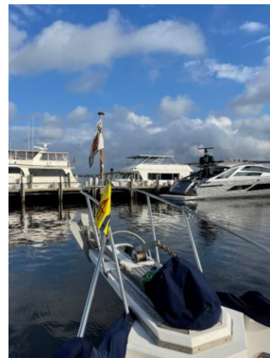
AISC burgee rubbing shoulders with all the other yachts in Ft. Myers.