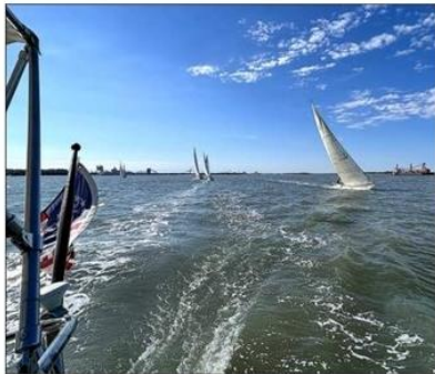
Looking back at the competition, this photo was taken from the deck on sailing vessel Misty that led the pack.

Amelia Island Sailing Club's annual Ice Bucket Challenge race was held on Saturday. Although the air temperature was not low enough for ice, it provided a cold start in gusty winds. The ebb water current that built up during the race provided challenges, but Saturday's wind created great sailing conditions.