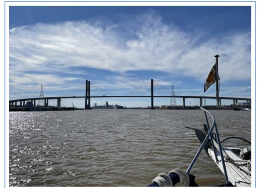
Mobile Alabama. 10°51'30" 44.44" N, 88° 2.51' W