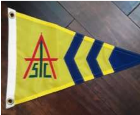
AISC Burgee (5 available) $15.00 each

Greetings members of the AISC! As your Quartermaster, I'll be looking into getting pricing on merchandise you may be interested in purchasing. I'll be seeking out items such as baseball caps, collared shirts, t-shirts, canvas tote bags, burgees, Tervis cups, etc. The following items are in stock (limited supply) and available for purchase. Please call/text your order to me at (904) 310-5797. Email: pcmooney9469@hotmail.com