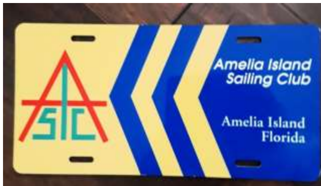
AISC License Plate (13 available) $10.00 each - NOW $5.00 each!