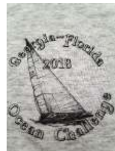
Limited Edition 2018 Georgia-Florida Ocean Challenge Polo Shirt. 2 color choices - Heather Grey and Light Blue. Hanes brand, 50/50 cotton/polyester Small (2 left), Medium (10 left), Large (4 left), X-Large (7 left), 2X-Large (2 left), 3X-Large (2 left) $15.00 each - NOW $10.00 each! - Great quality at a fantastic price!