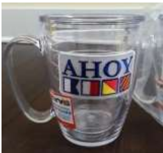
Genuine Tervis 16-oz Mug (2 available) Keeps drinks hot & cold, lifetime guarantee $10.00 each - NOW $6.00 each!