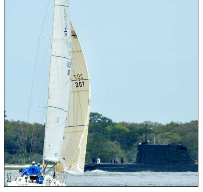
The fleet heads to the second mark, above. Valkyrie and the submarine, below left. Tiger Tale, below right. More photos, 2B.