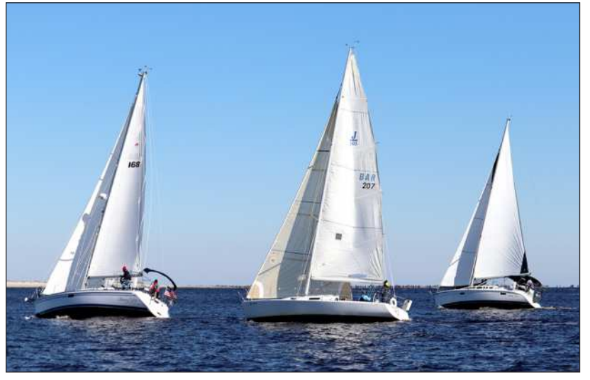
Morning Glory leads Valkyrie and Salty Sally right after start.

Members have sailboats, power boats and pontoon boats, and many have no boats. The club holds monthly dinner meetings, monthly races and other social events throughout the year.